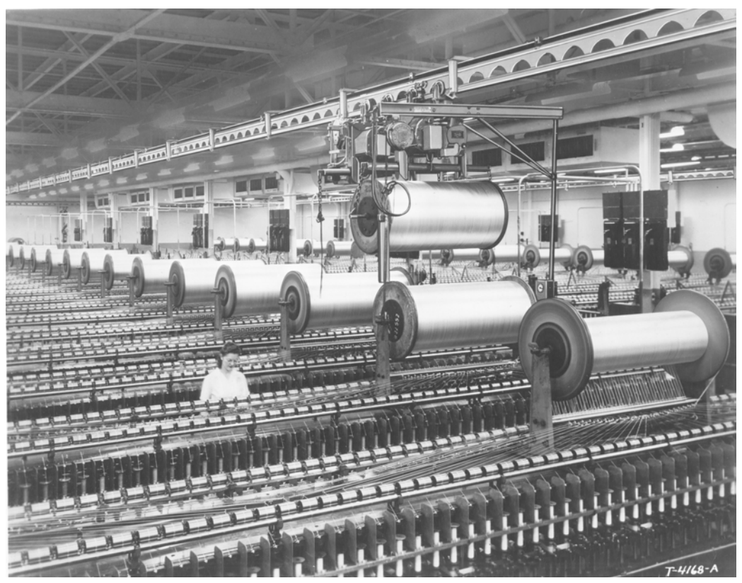
Production of rayon cord at the Scottsville U.S. Rubber Company