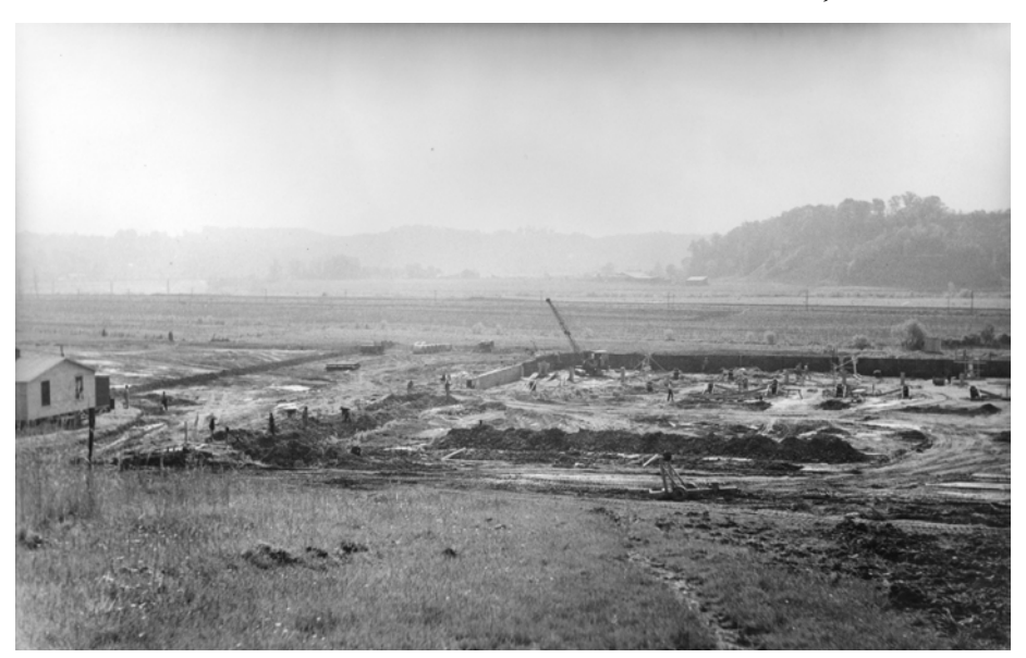
Excavation at the U.S. Rubber Plant site began in early 1944 at a site just west of Scottsville. This photo was taken circa April 1944, looking south at the plant site with the James River in the background.