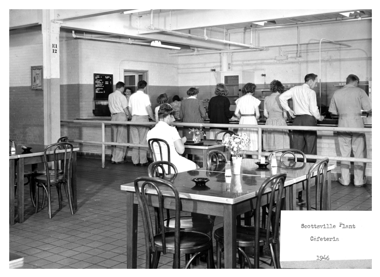
The cafeteria at the Uniroyal Plant (previously the U.S. Rubber Plant) in 1946.