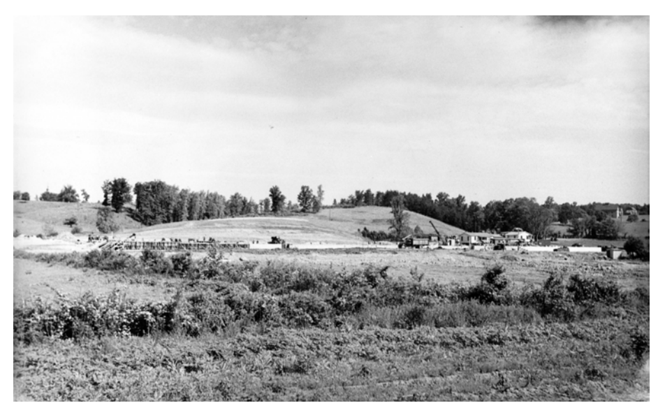
This photo was taken on May 18, 1944, looking north at the plant construction in process from the C&O Railroad track.