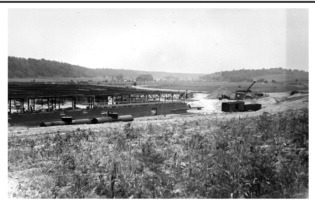
More Photos of U.S. Rubber Plant Construction, 1944