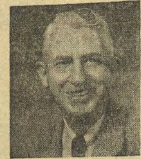
TED DALTON Candidate for Governor