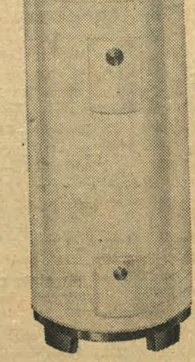
Table-top models also available